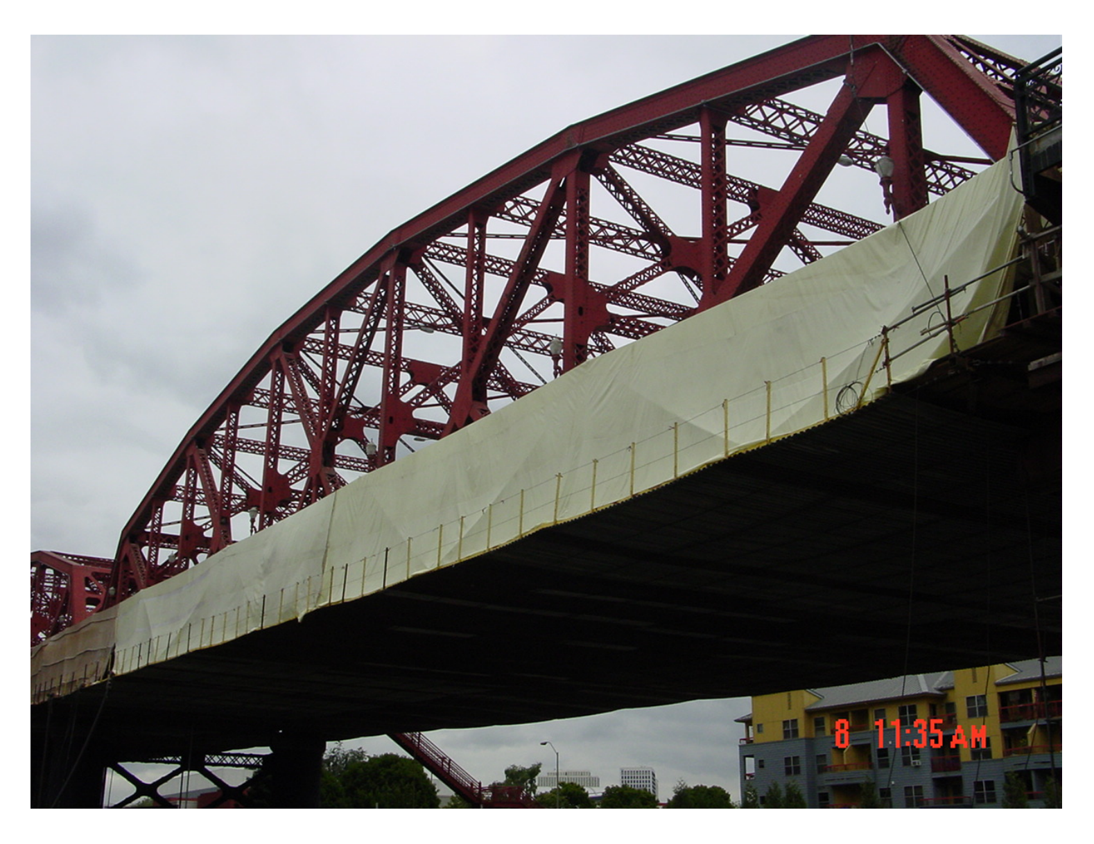
Cable Supported/Metal Deck Platform System & Containment