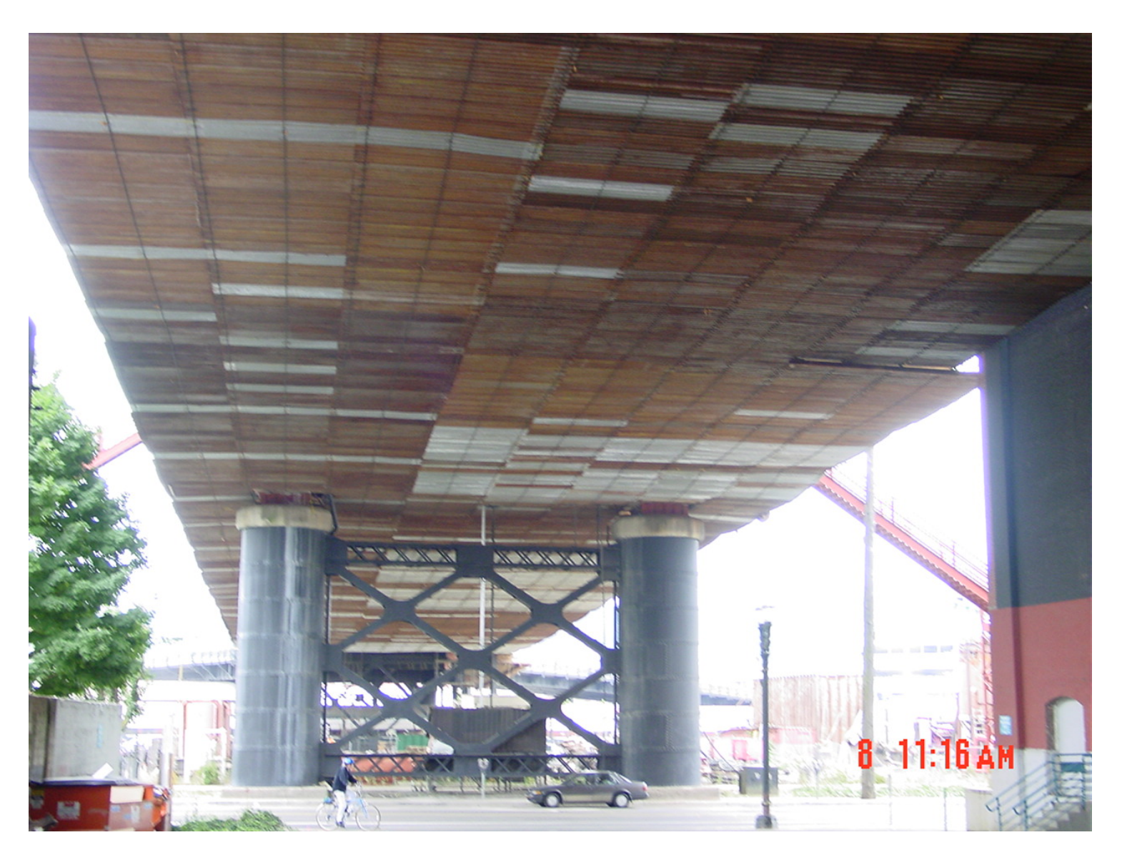
Cable Supported/Metal Deck Platform System Spans 5, 6, & 7