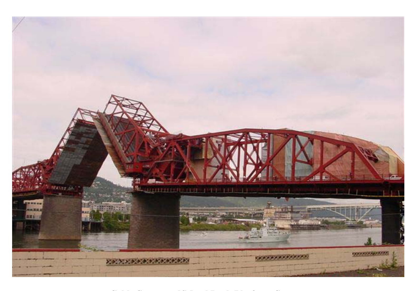
Cable Supported/Metal Deck Platform System Bascule Span Center – Truss Right W/ Containment