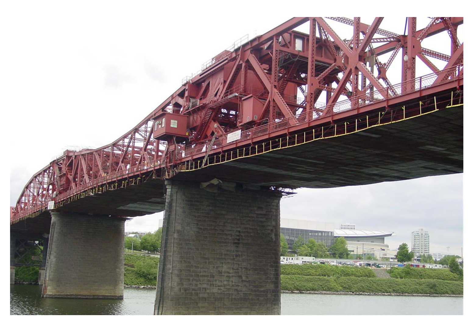
Cable Supported/Metal Deck Platform System Bascule Span Center – Truss Spans left & Right