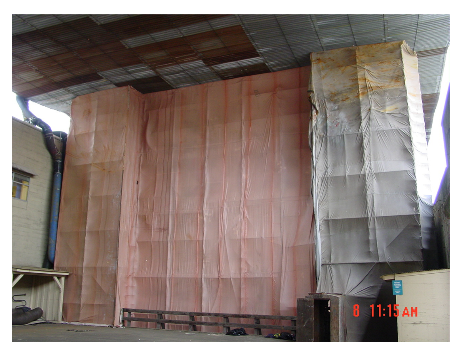
Cable Supported/Metal Deck Platform System Above Scaffold/Containment Around Bent Below